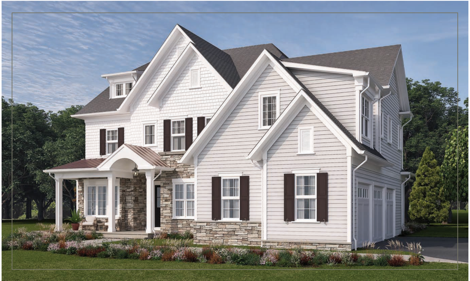
2110 Union Hill Rd, Malvern, PA 19355